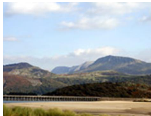
View towards Barmouth