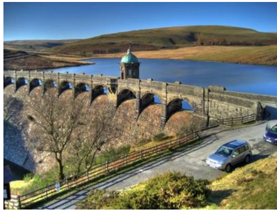
Right: Rheidol Steam train