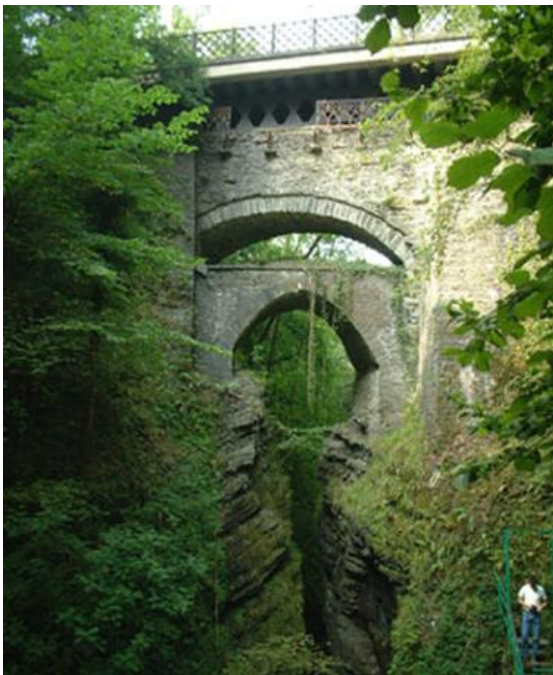
Left: Devil's Bridge

We have planned a week-end day driving to Rhayader along the Elan valley, with its stone dams, to Devil's Bridge. After morning coffee there's a choice: spend a peaceful afternoon in the valley around the bridges and possibly a visit to the kite feeding centre, a trip to Aberystwyth on the Vale of Rheidol steam train, or a visit to the Llywernog silver-lead mine, currently being revamped as the "Silver Mountain Experience" (we plan to visit this in May to see what the new experience is!). The return trip for all is along the local village roads to the hotel.