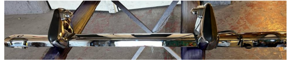
Rechromed rear bumper with the numberplate illuminators on the overriders. The work was carried out by a rechroming specialist in the West Midlands.