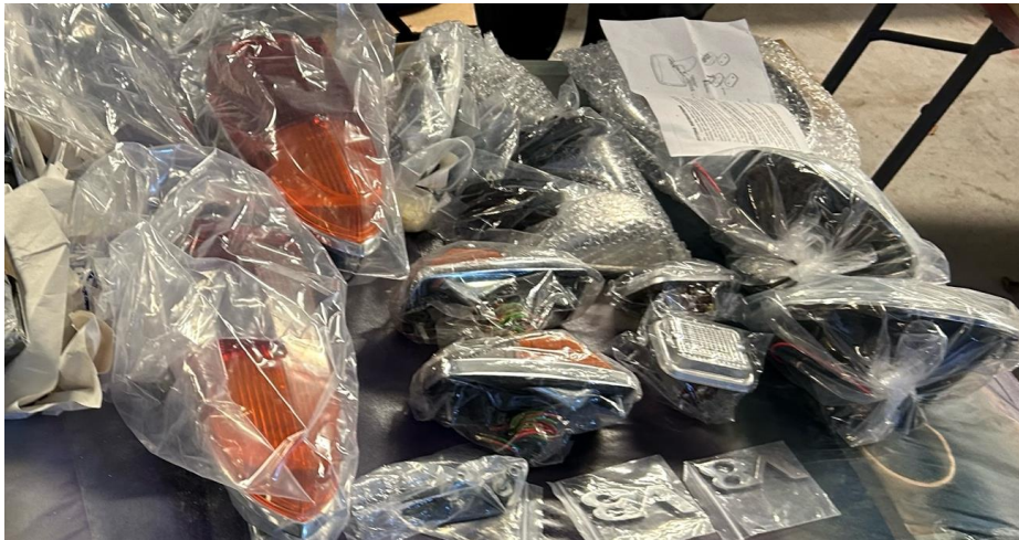
Lights waiting to be reinstalled to the freshly painted MGBGTV8.