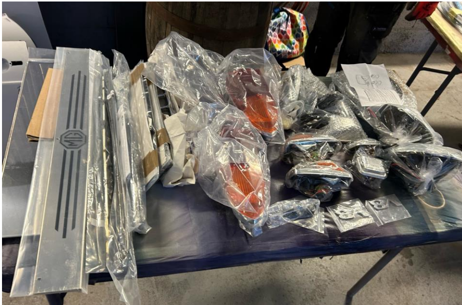
Many parts are bagged-up waiting to go back into and on the MGBGT V8.