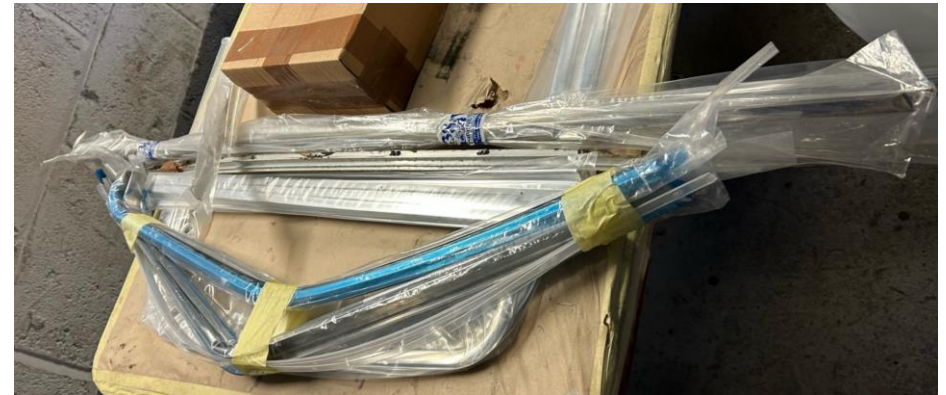
More parts have been sourced ready for fitting the car as part of the detailed restoration.