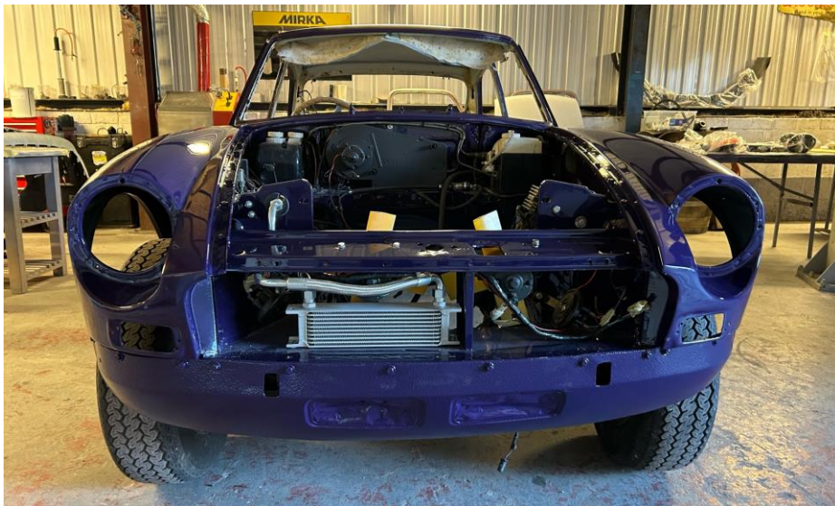
Parts are being returned to the engine bay – cooling fans, oil cooler and the equipment on the bulkhead is beginning to go back.