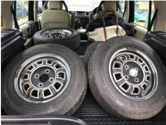
Original, sharp and unrestored centre castings