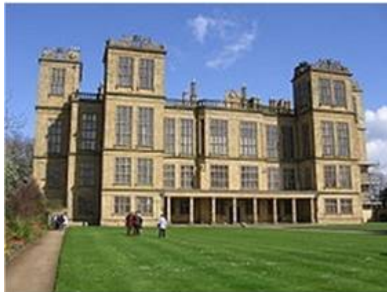
Day at Hardwick Hall in Derbyshire