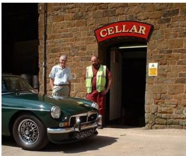
Hook Norton Brewery tour and Pear Tree lunch