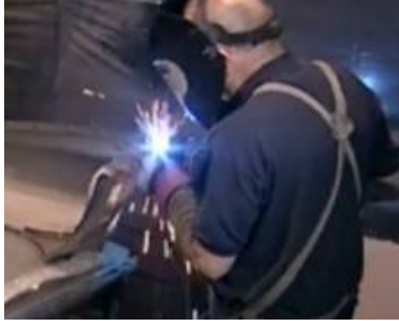
BMH Body Plant tour