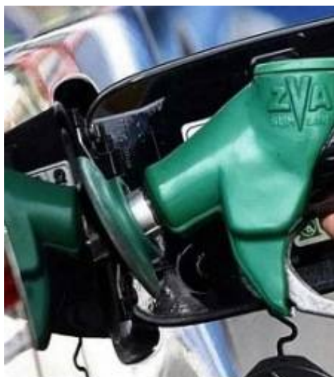
Ethanol fuel and the MGBGT V8