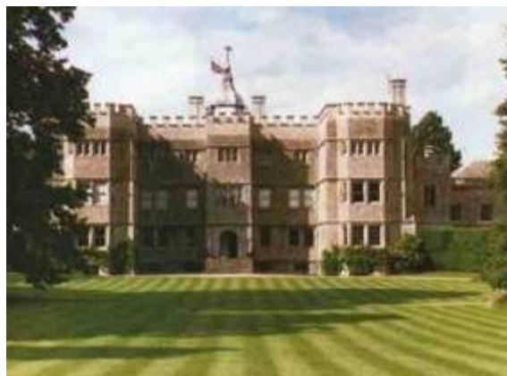
Rousham House and gardens