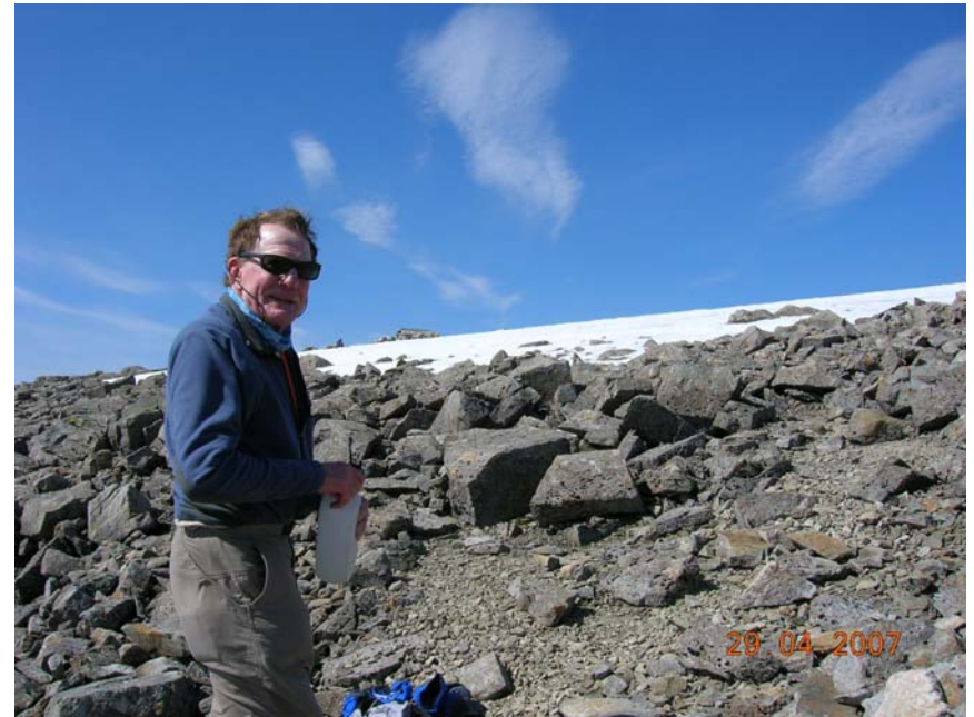
Warm enough for a stop for scoff before hitting the snowfield on the plateau just above. Weather conditions were just about perfect with hardly any wind other than a breeze on the arête where the air flows over into the corrie below. The cold air produced excellent views with little haze.

victorsmith@fosterwyatt.com 07770 822977 5.5.07