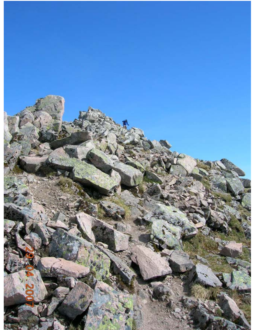
The going is hard work at this stage