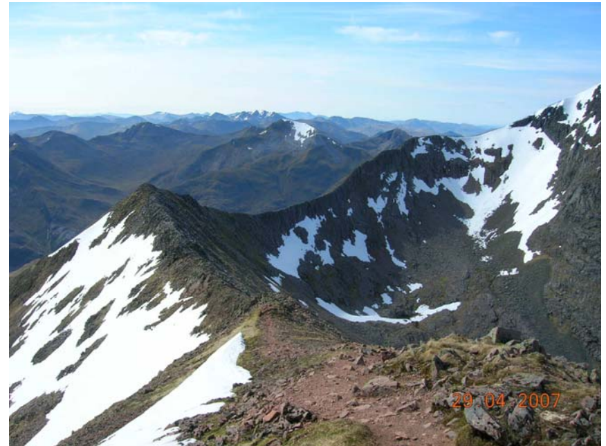
On from CMD onto the arête