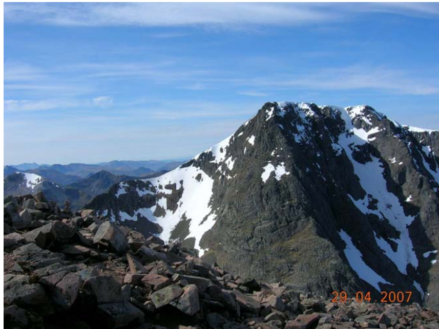
Final section of the climb comes into view

victorsmith@fosterwyatt.com 07770 822977 5.5.07