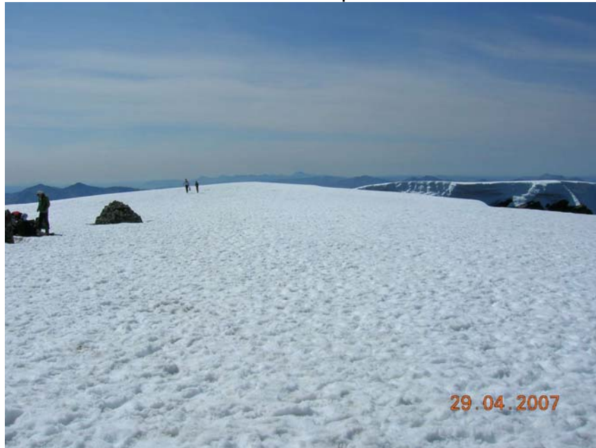
Route off the Ben needs great care in poor visibility – a gully to the right with a long drop and another dangerous area if you go straight on.