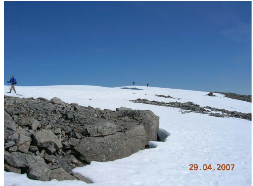
Looking up to the plateau from the end of tourist route – see the gully (the tourists above are heading straight for it but fortunately they will see it)