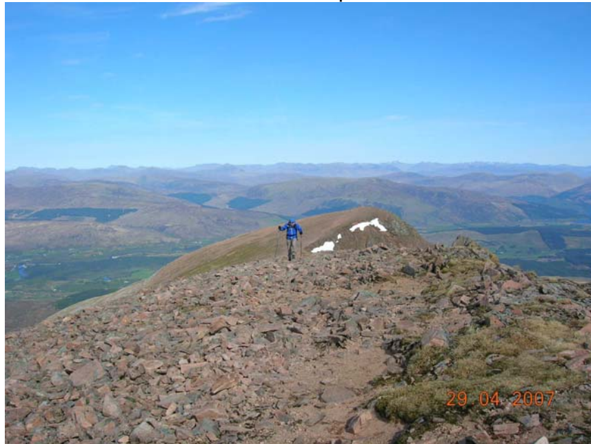
Continuing to 4,000ft