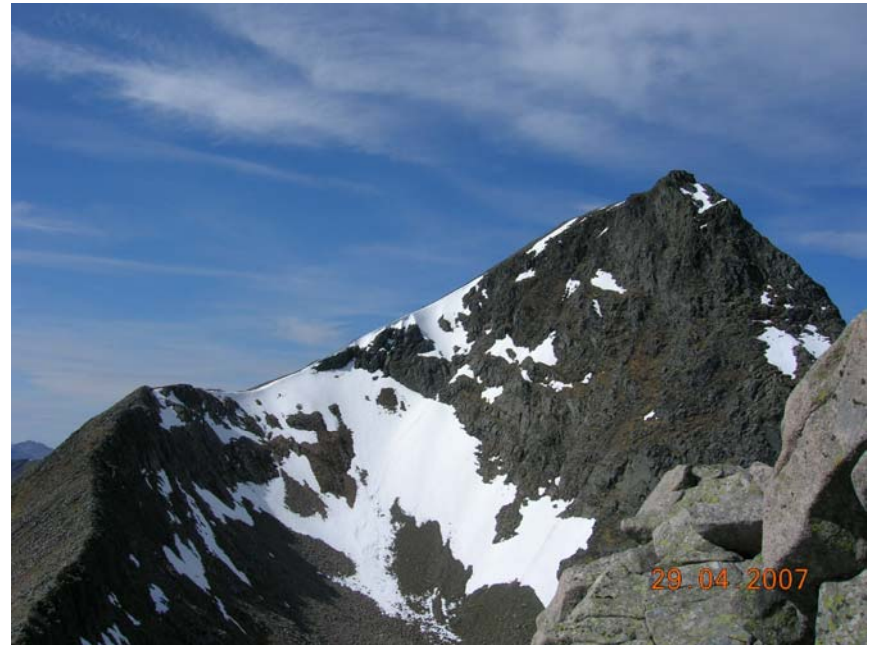
Second stage on the arête