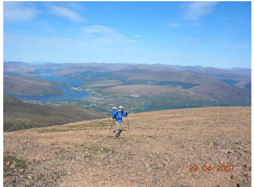
Looking back down the CMD shoulder to Torlundy