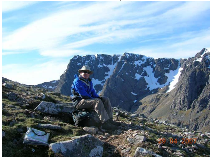
On climb up to CMD – north face of the Ben