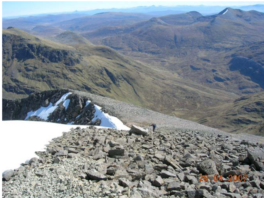
Looking back from the final section up to the top

victorsmith@fosterwyatt.com 07770 822977 5.5.07