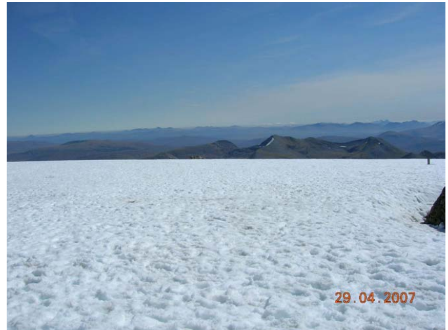
Looking north west over the north face