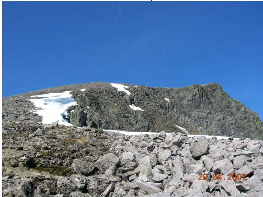
Off the arête with the final section – large broken rock