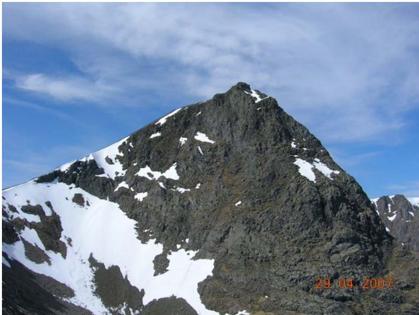
Final section to the top

victorsmith@fosterwyatt.com 07770 822977 5.5.07