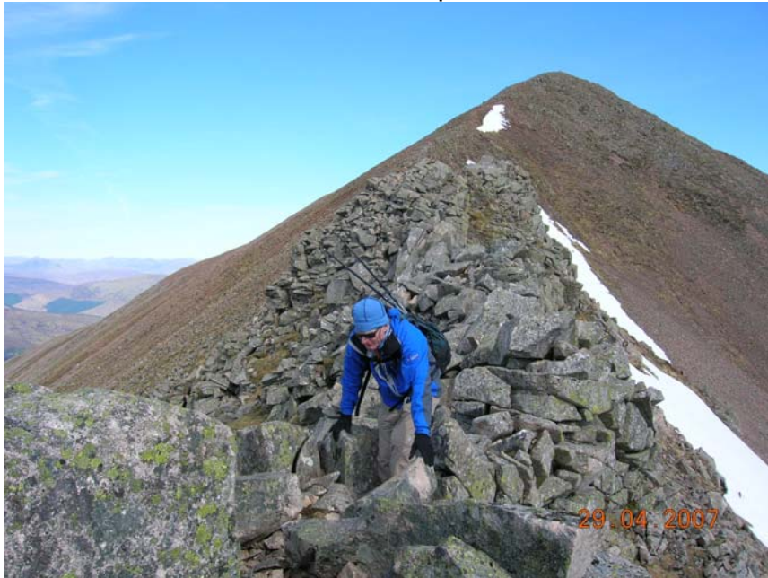
Chunky rocks on the arête – good grip in the dry