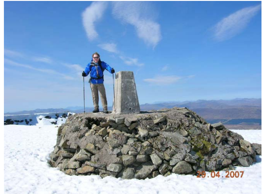
Trig point on the top