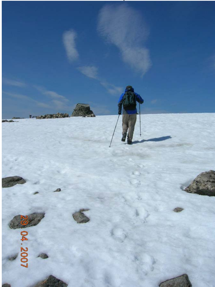
Off the broken rock onto the snowfield with the emergency hut in view