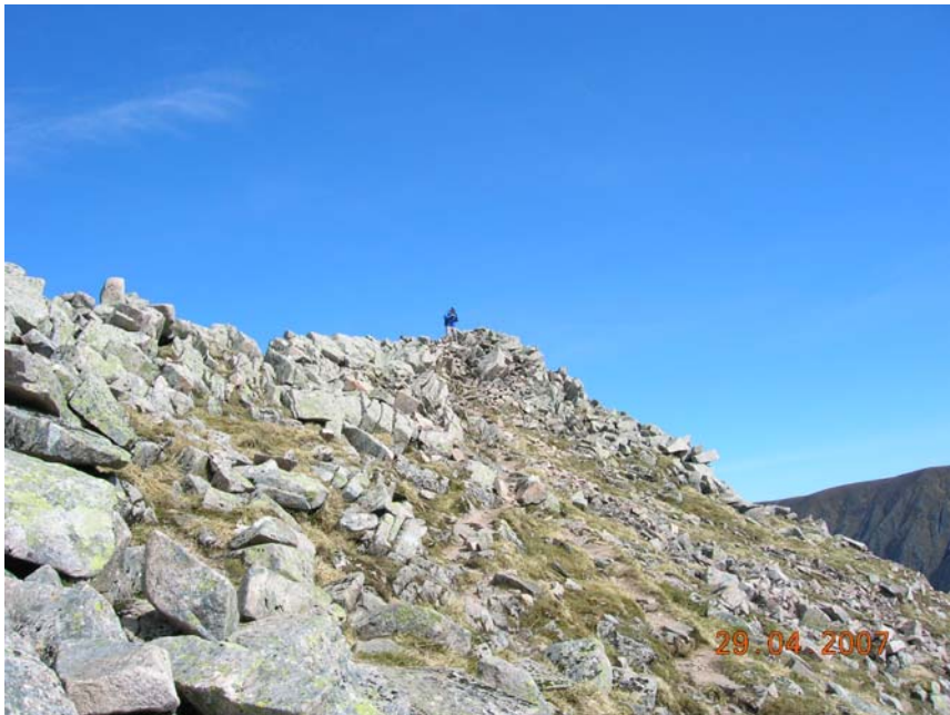
Arete goes up and down quite a bit

victorsmith@fosterwyatt.com 07770 822977 5.5.07