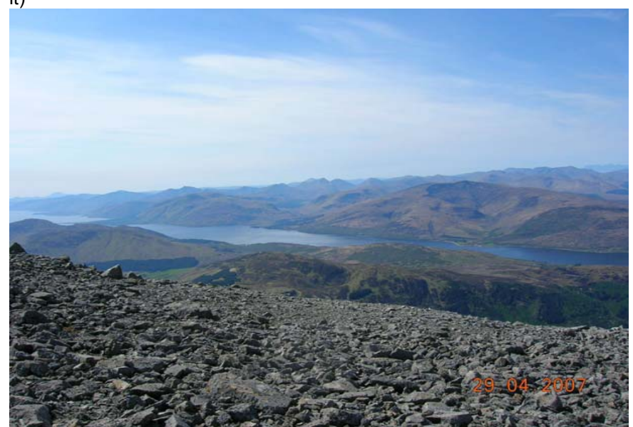
Looking down to Loch Linnhe and over to Ardgour