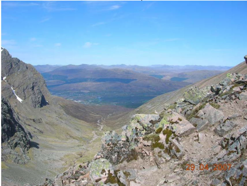
From the middle of the arête looking into the corrie under the north face