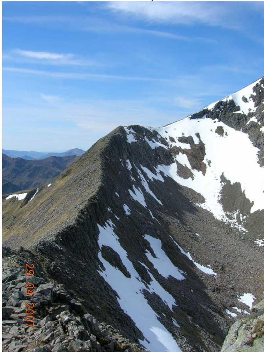
The section before the snow needs care