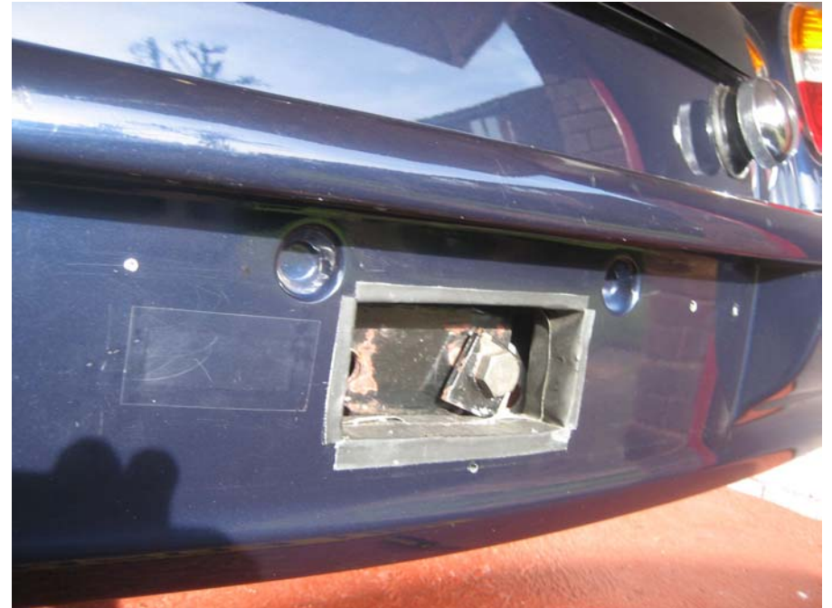
Page 1 - "Drop bar" which connects through the bumper.

Pages 1 and 2 - The bumper hole is completely hidden once the number plate is replaced. I connected all the electrics to a standard 7 pin socket which was also hidden behind the bumper to maintain the "secret" installation.