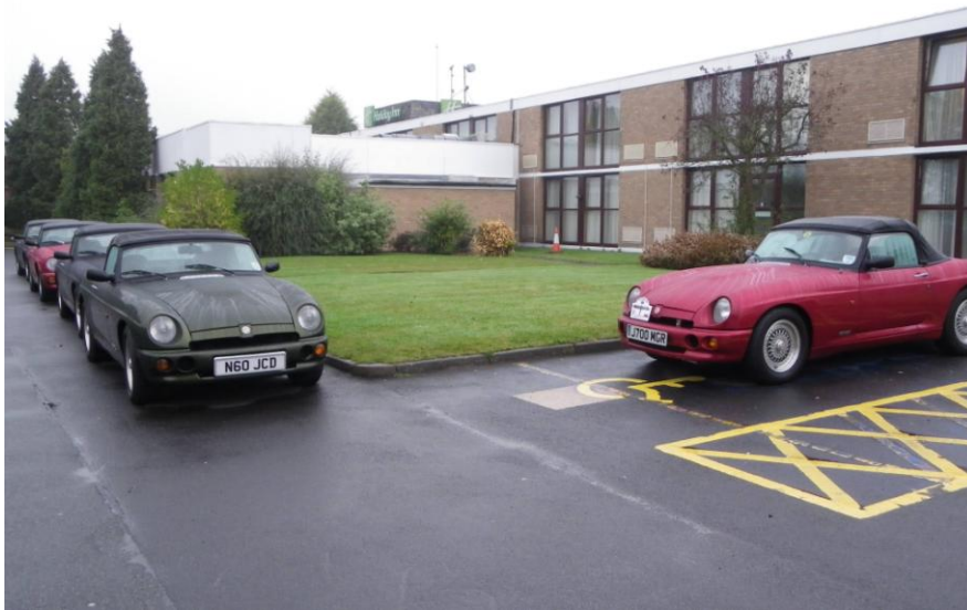
Damp start to Saturday