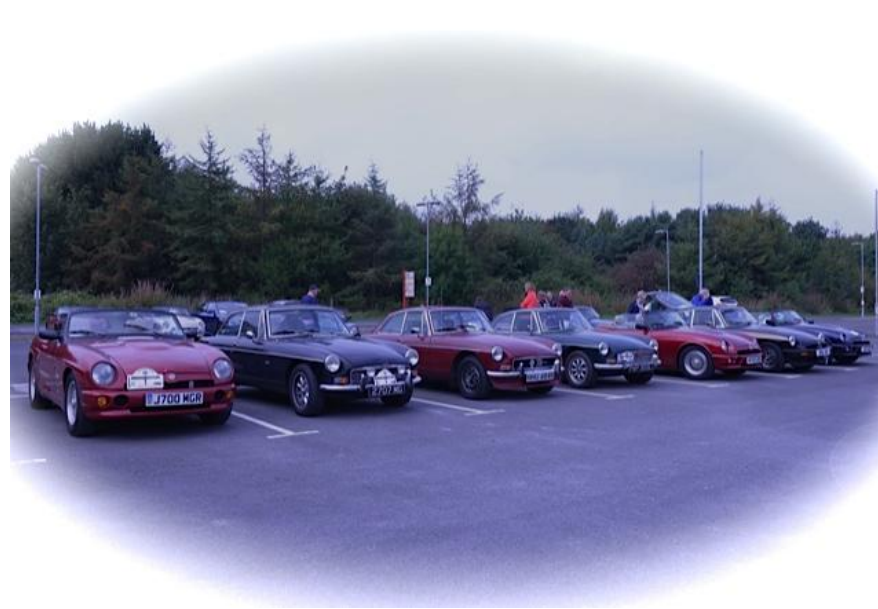
Assembled at Woodhorn Colliery