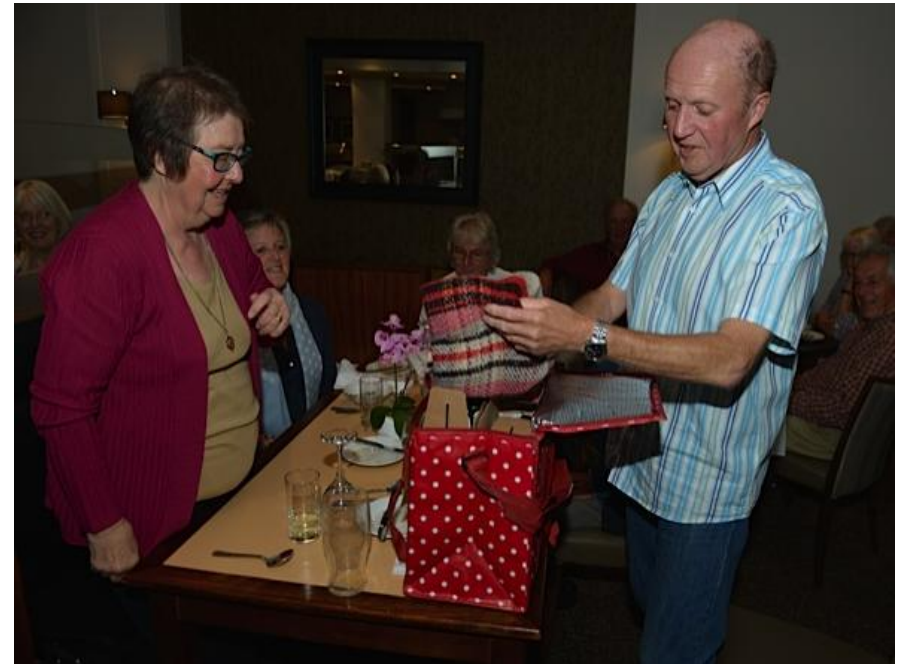
Greatly appreciated gifts