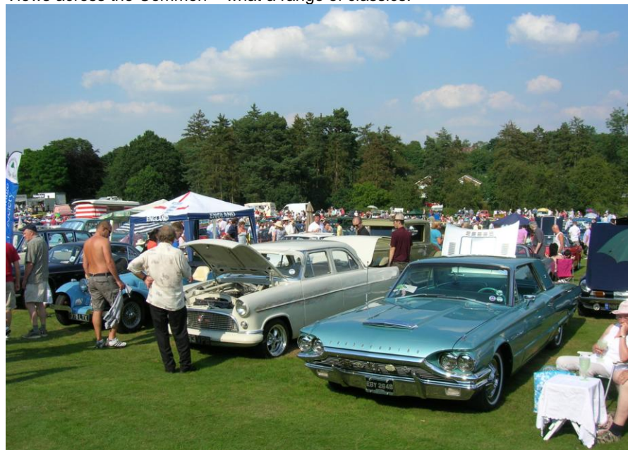
A party atmosphere had set in by the time tea arrived!