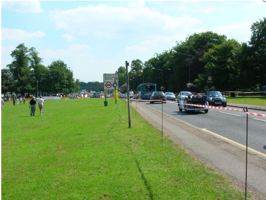
Common - by 7pm the green area in the foreground was full of classic cars.