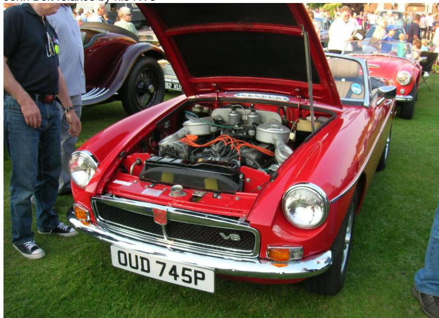
Rob Forbes' good looking V8 Roadster.