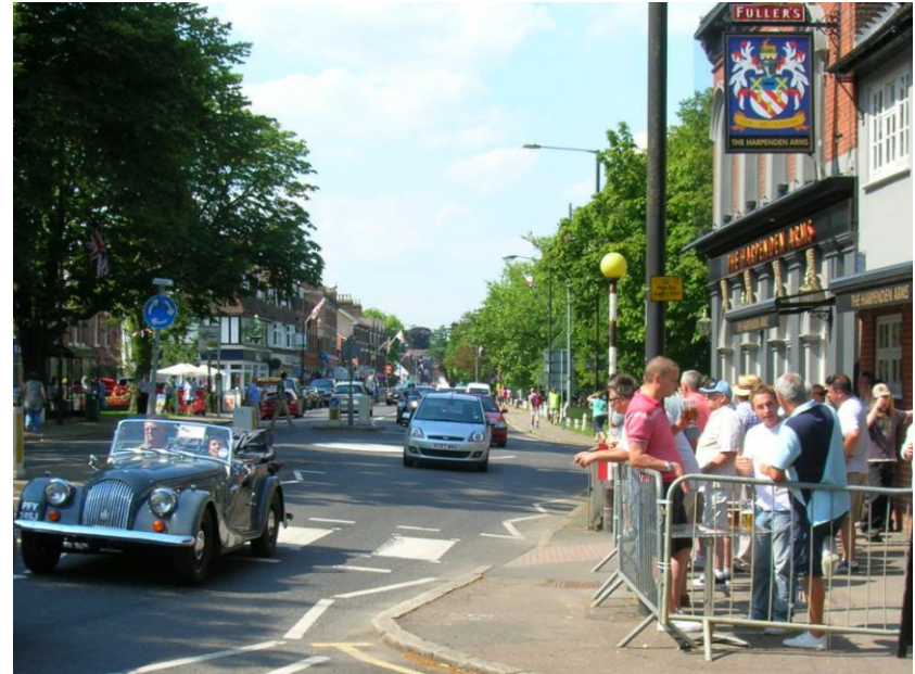
Spectators outside the Harpenden Arms watch the classics stream by to the Common