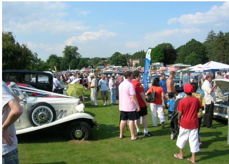
Views across the Common – what a range of classics.