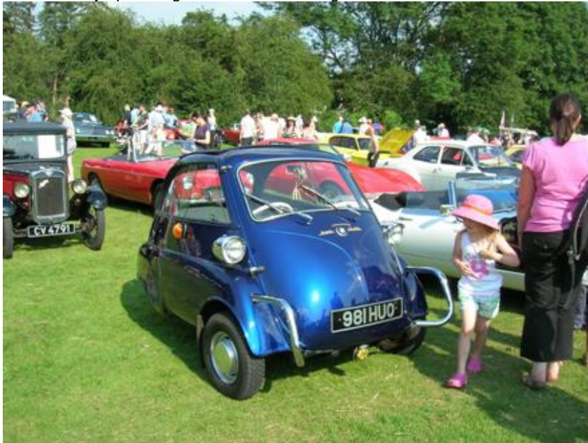
The range of cars on display was extraordinary.