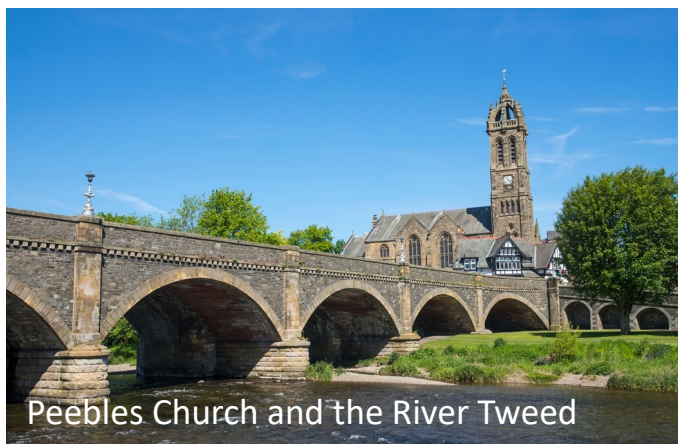
Peebles Church and the River Tweed