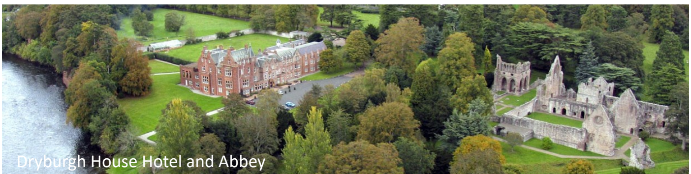
Dryburgh House Hotel and Abbey

The Sunday run will take us on a trip through the Tweed Valley towards the source of the Tweed and then across to Tweedsmuir and through Megget Water valley with lunch arranged at the Dryburgh Abbey Hotel, thereafter heading back to Peebles.