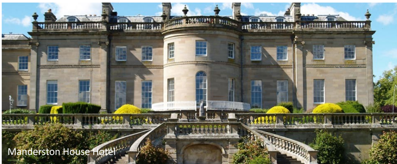
Manderston House Hotel

Demand for this event is always strong so please book early.