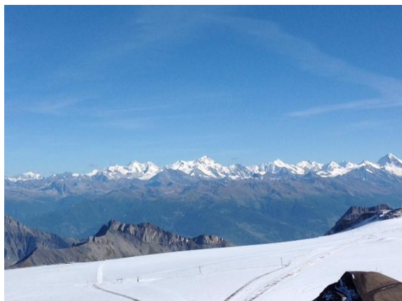
Panoramic view taken at 3,000m and a glacier.