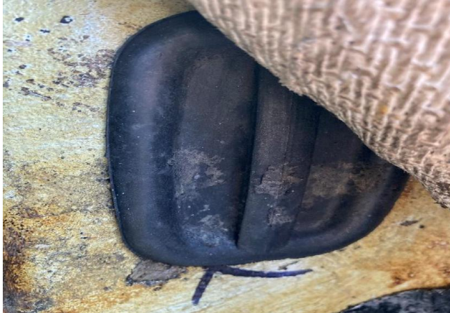
Figure 3 – rubber blanking plug