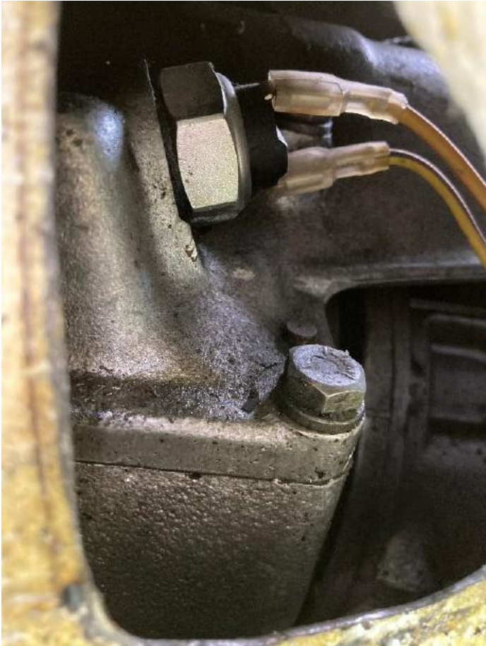
Figure 1 – inhibitor switch accessed by a rubber plug