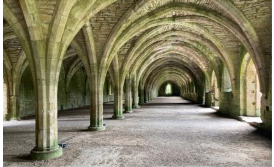
Cellarium at Fountains Abbey