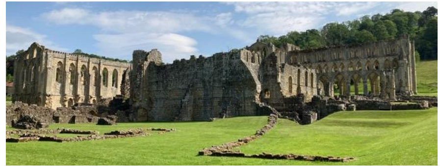
Rievaulx Abbey near Helmsley was a Cistercian abbey and was one of the great abbeys in England until it was seized in 1538 under Henry VIII during the Dissolution of the Monasteries.