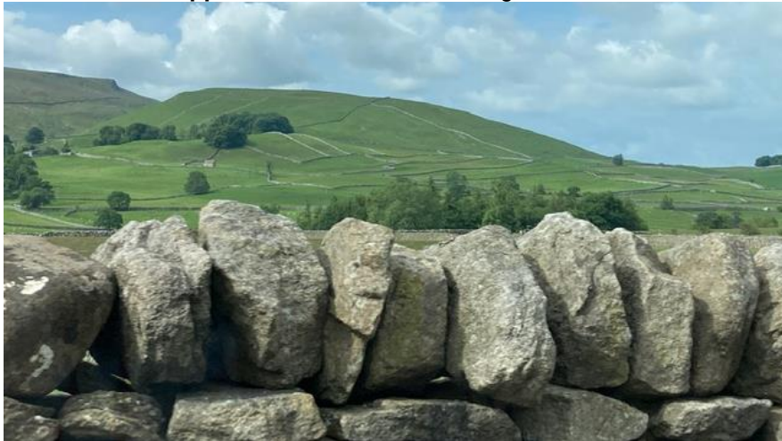
Near Skipton with a well maintained dry stone wall by the road.