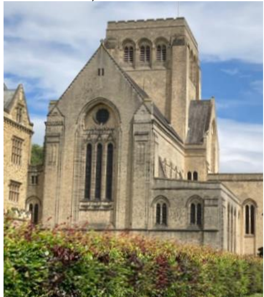
Ampleforth Abbey with the school nearby.