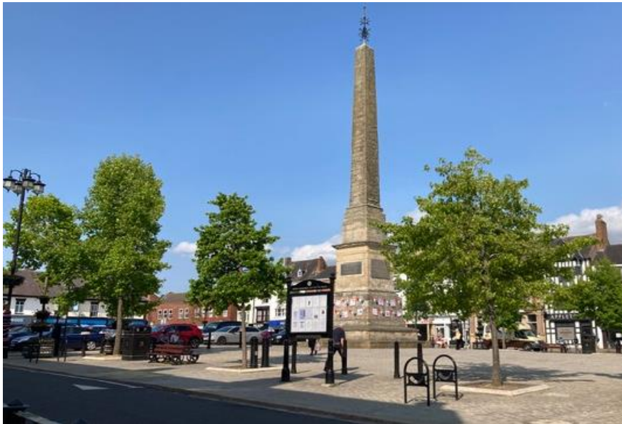
Market Place in Ripon - every night of the year without fail, a horn is blown at the four corners of the Obelisk in Ripon Market Place to set the 'watch' and then outside the house of the Mayor. This ceremony commemorates the time in the Middle Ages when Ripon's Wakeman was responsible for crime prevention in the city from 9 pm until dawn.