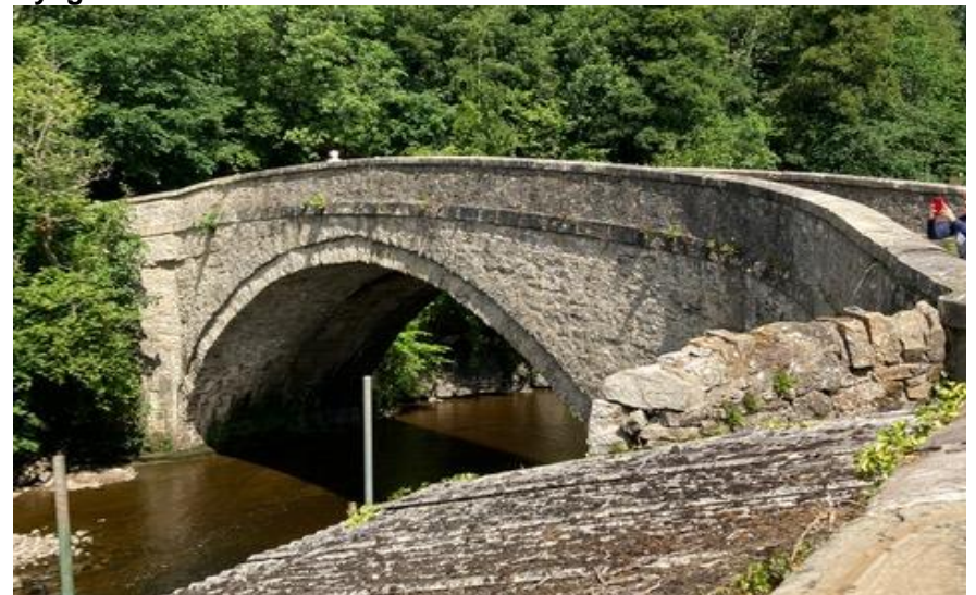
Bridge over the River Ure below the Aysgarth Falls