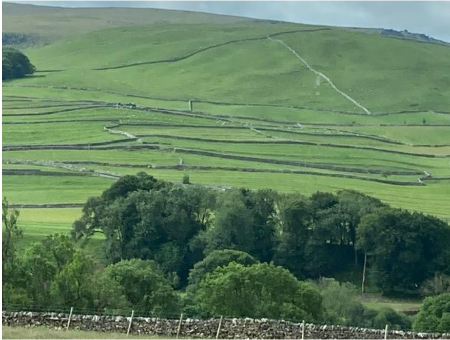
Grassington looking up to the hills.