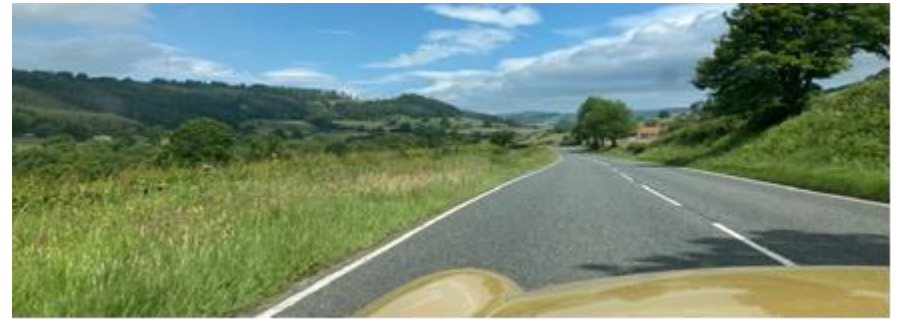
On the road near Helmsey