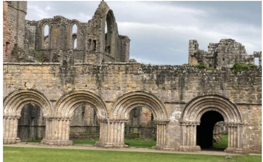
Cloisters at Fountains Abbey