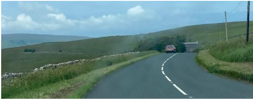
On the road to Appplewick with Richard Withington's MGBGTV8 ahead.