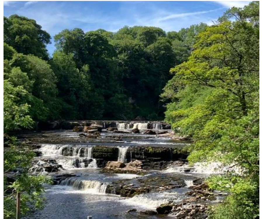
Aysgarth Falls on the River Ure