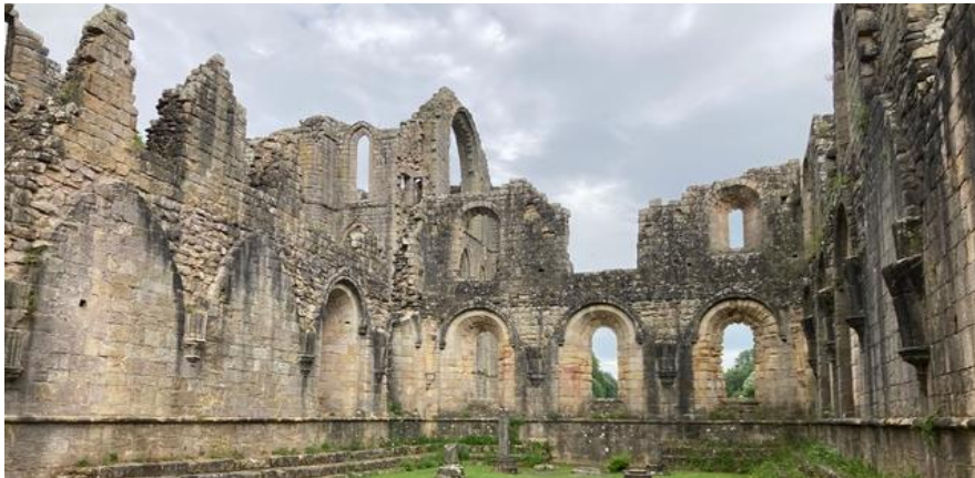
Chapter Houser at Fountains Abbey