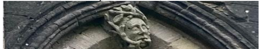
Green Man at Fountains Abbey